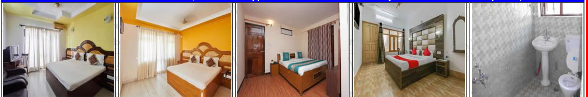
Hotel Photos for Super Deluxe Tour ( Hotel Tariff Approx Rs. 2800/- To 3100/- Per Day / Per Room With Breakfast)