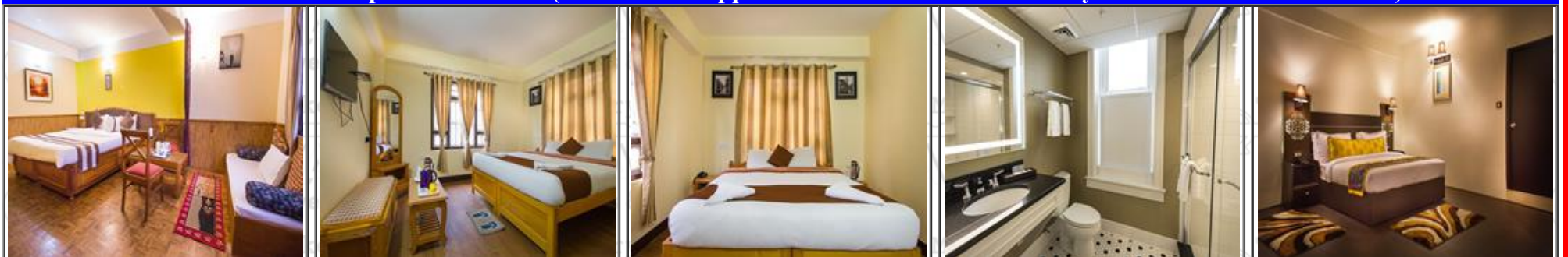
Hotel Photos for Super Deluxe Luxurious Tour ( Hotel Tariff Approx Rs. 4800/- To 5300/- Per Day / Per Room With Breakfast)